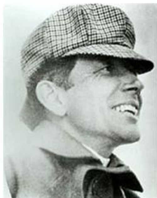
William C. Durant